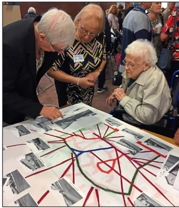
Looking through old maps of Doxey